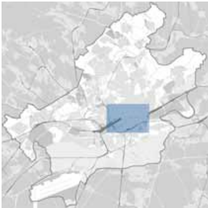
The blue area presents the part of the city model

Urban planners, architects and investors all use the model to visualize urban development planning and to weigh up the pros and cons of specific aspects, for example how one building will cast a shadow over others.