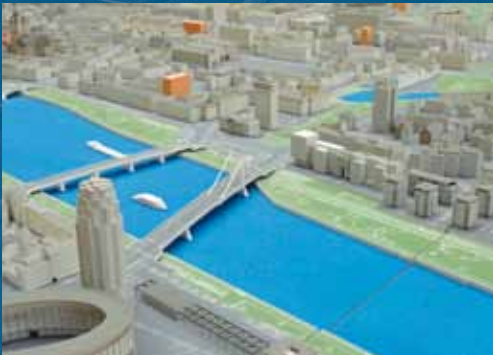
The city modell in the atrium of the planning department

Visitor opening hours: Monday – Friday: 8.30 am – 6.00 pm