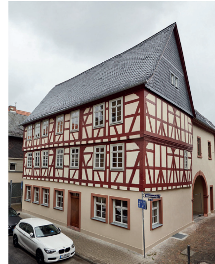
Renovated in accordance with listed buildings „The Golden Eagle“

After the renovation, the building shines in the district, especially the half-timbered uncovering pleases not only the people of Höchst, also due to the membership of the district of Höchst in the German Half-Timbered House Route, the uncovering is of special significance.