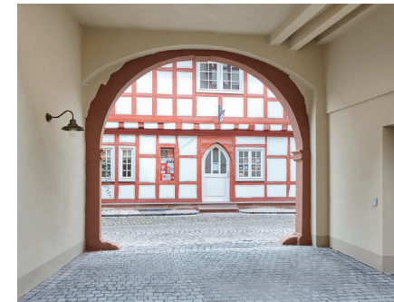
Entrance © Michael Meisen